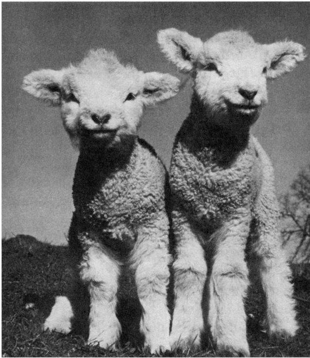
H. Armstrong Roberts

But each time, Pharaoh refused to free the children of Israel. One by one the plagues afflicted Egypt. Each plague brought greater destruction than the one before. Egypt was quickly becoming a ruined nation.